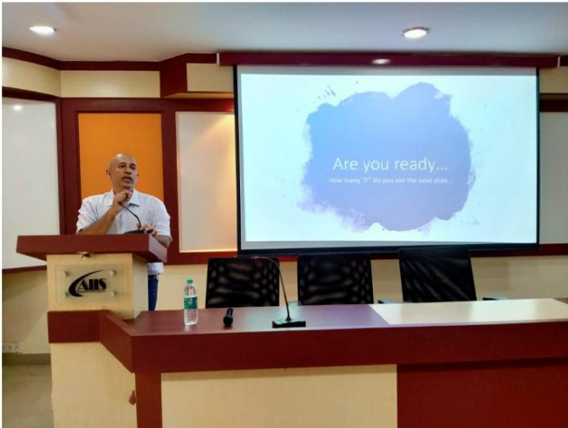
SOFTWARE DEVELOPMENT CYCLE