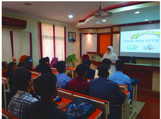
FOOD AND NUTRITION