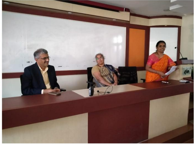
MOB LYNCING AND CYBER CRIME